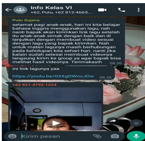
Figure 1. Pre-activity

It can be seen that the implementation of song in teaching speaking can be seen in pre-activity when the teacher related the learning theme to the songs (apperception activity) as well in introducing the material by using song by giving the link for the song. The teacher used everyday life song that students are used to listening in which in teaching greeting, the teacher used song from YouTube.